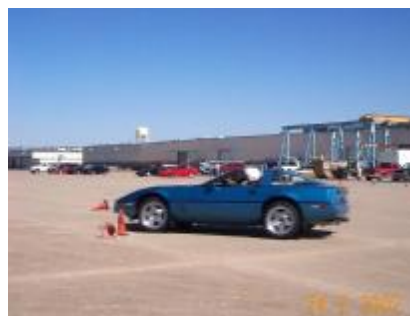
Solo II Strother Field February 24, 2002