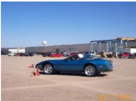
The Doctor is in!